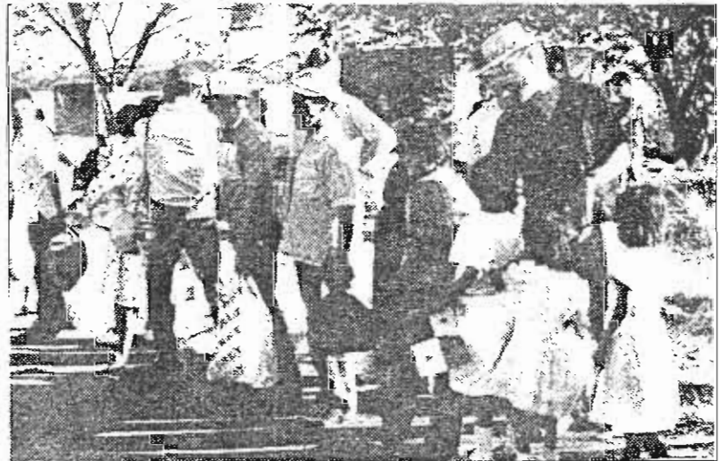
PBI volunteer escorting returned refugees from the Ciudad Romero Community

Many rural communities suffered from increased vigilance and harassment by the military. This was especially true of repatriated communities. In some of the newer communities PBI had presences a great portion of the time such as in Ciudad Romero and Nueva Esperanza. Many other communities also petitioned to have visits during the year.