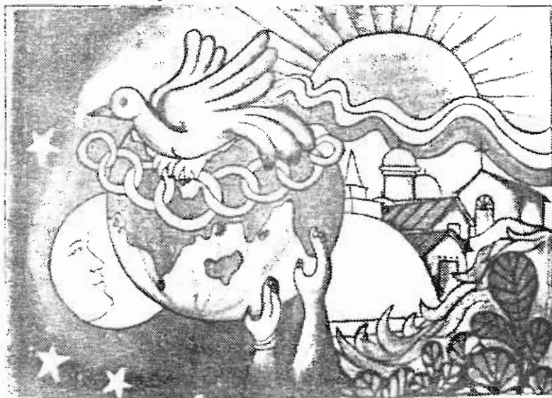
Mural painted by Sri Lankan children

When PBI first sent a team to Sri Lanka in 1989, the South of the country was in the midst of an insurrection led by the JVP (People's Liberation Front). By the end of 1990, that uprising had been effectively crushed by the Sri Lankan armed forces and pro-government vigilantes, at a cost of as many as 60 000 disappeared over a 3-year period. Most of these are presumed dead, but several thousand are still held in detention camps.