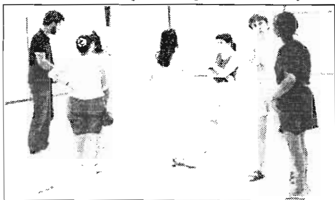
PBI-NAP training in a Mohawk community

The main task of the Project Exploratory Committee during 1991 was to accompany the investigation of the North America Project (NAP). Meanwhile, the contacts and development of NAP in the field were carried out by PBI members in the area; PEC contributed by proposing some criteria for domestic projects, linking the NAP exploration with the established PEC procedure, involving the rest of the PBI groups through consultation, and asking critical questions. It was not easy to keep in touch or to find interest outside of North America; the exploration process was very slow.