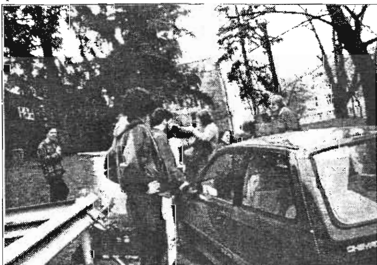
Simulated road-block confrontation at North America Project training in Kingston, Ontario

Meanwhile the NAP committee has continued to meet, explore the work, and develop the infrastructure to support a new project while the rest of the organisation has been going through the process of investigating and approving it. Fortunately this process has coincided with a period of efforts to address First Nations issues in the legal and political arenas which has led to fewer blockades in Canada in 1991. PBI-NAP hopes to be prepared to respond to future requests from First Nations people and to support people committed to nonviolence in potential conflicts across the continent.✽