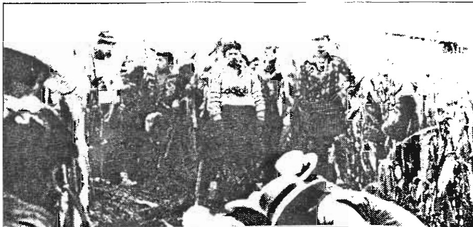
Exhumations in Pujujilito II, Sololá