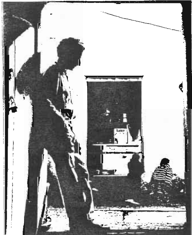
PBI team member at work

UNSI TRAGUA: United Labour Organisation of Guatemala GAM: Mutual Support Group for Relatives of the Disappeared CERJ: Council of Ethnic Communities "Everyone Equal"