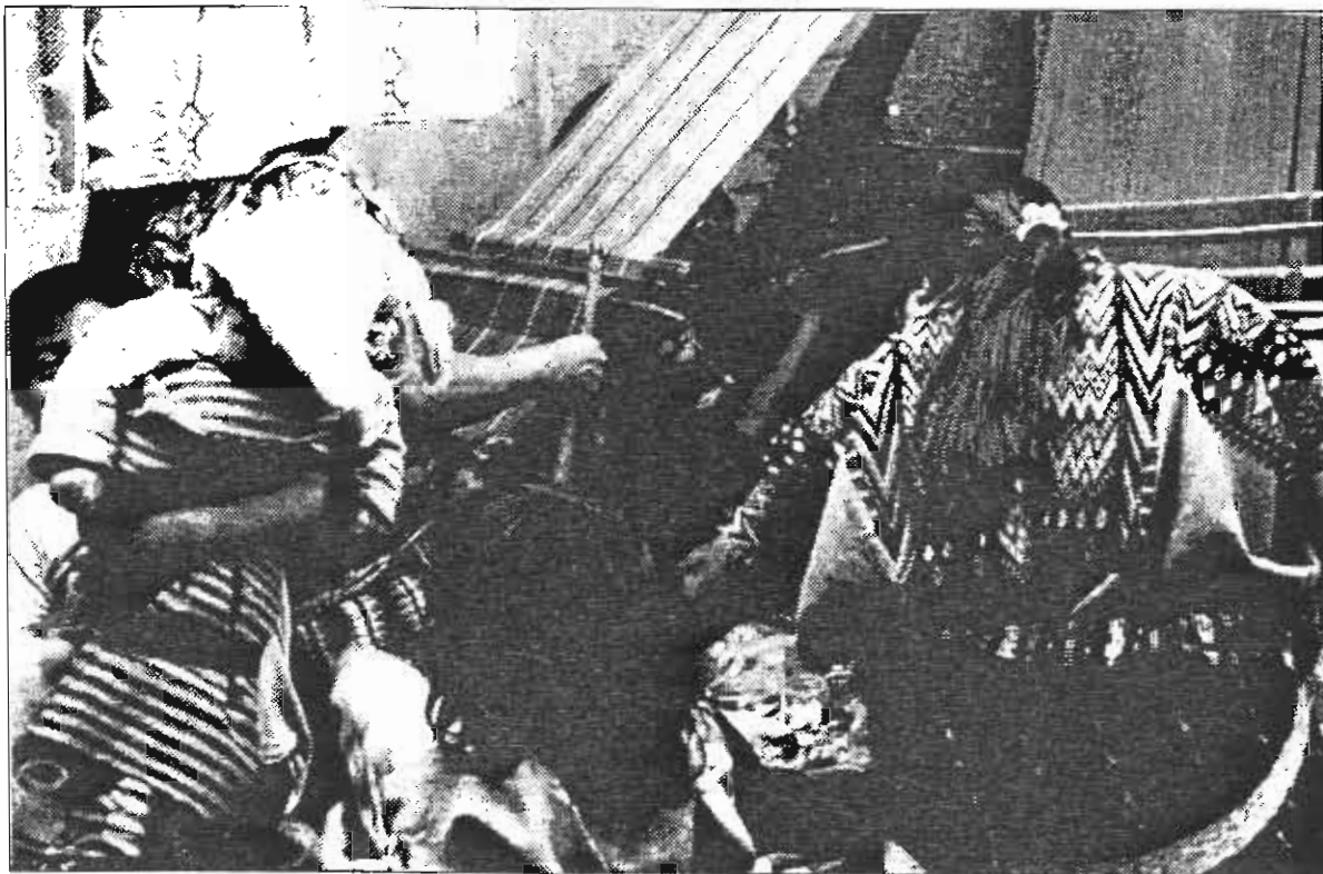
Guatemalan women and children at a weaving cooperative

However, many view this handful of examples as "cosmetic"; designed to appease international critics but lacking in true political will. The list of unsolved cases is far greater. Assassinations, disappearances, kidnappings, forced recruitment, threats and intimidations occur with regularity against individuals and groups working for social justice by nonviolent means.